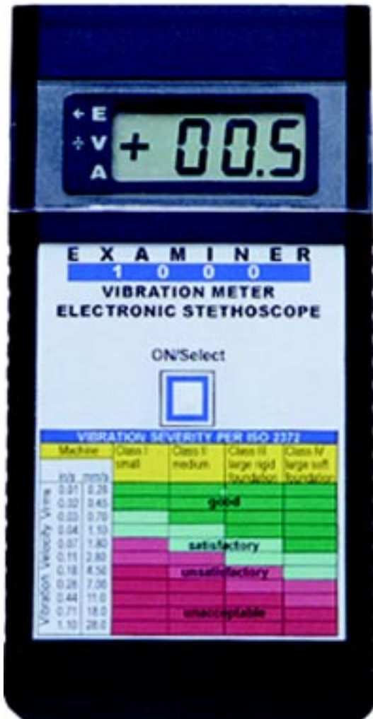
EXAMINER 1000 Made in the USA