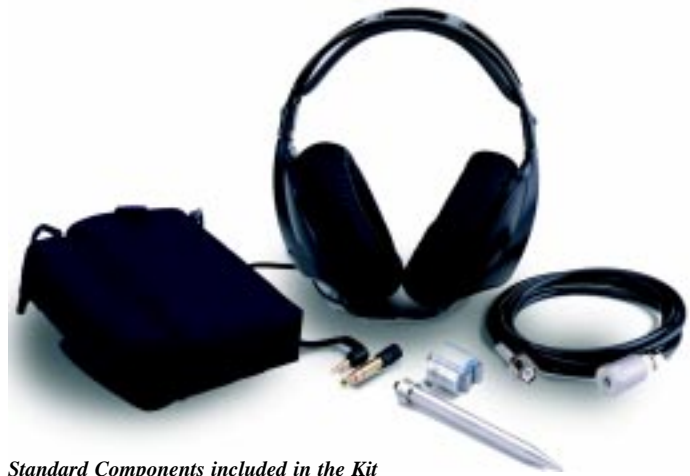
Standard Components included in the Kit

“Hear what you feel.” A Craftsman’s experience is hard to replace. The EXAMINER 1000 is a digital electronic stethoscope providing the human interface needed to understand and confirm vibration values on the display. The provided headphones allow the Craftsman to use techniques they already know to gain confidence in the use of the EXAMINER and vibration trending techniques.